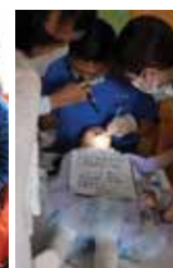
Children waiting for dental checkup