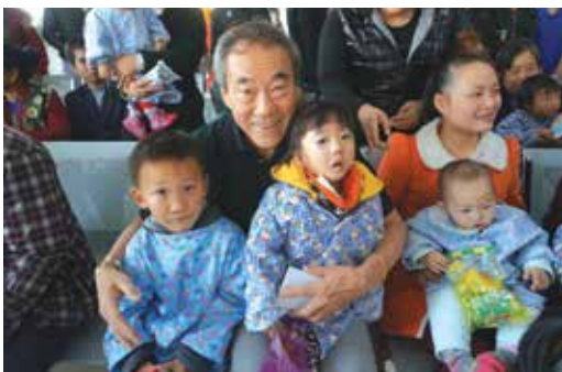
Charles B. Wang

I treasure memories of my contacts and discussions with Charles. In 2011, when I organized the 3 rd ICPF workshop in San Francisco, thanks to Charles B. Wang, Smile Train was one of the major sponsors of that workshop and it allowed many colleagues from low-and-middle-income countries to attend.