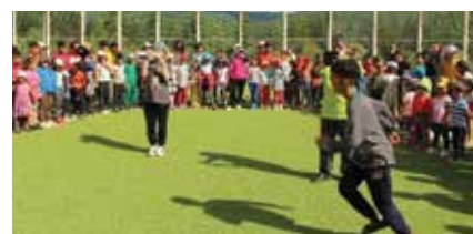
We had a happy time playing with children of an orphanage in Mongolia that we visited for volunteer dental treatment