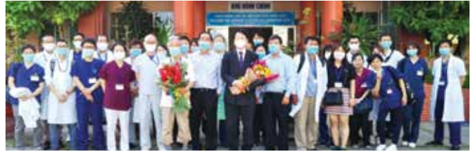
A team of medical volunteer specialists at Nguyen Dinh Chieu Hospital, in Ben Tre Province, Vietnam in 2020. They conducted medical technology transfer and research for children with cleft lip and/or cleft palate. (February 23 - March 4, 2020)